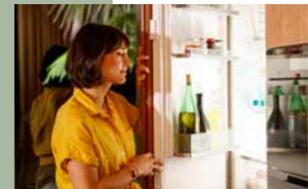
Relaxed living with backup power