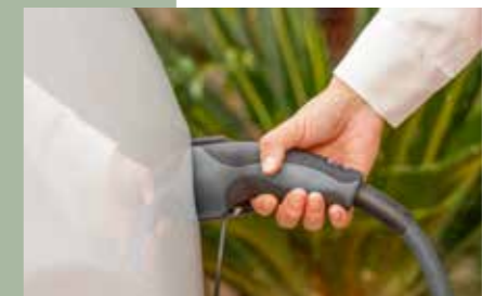
More possibilities with solar energy